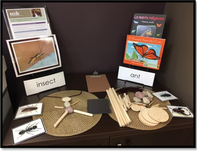
Build- A-Bug with Natural Loose Parts

With a magnifying glass, clipboard, pond plants, fabric, various wildlife animals and more, this provocation for learning kit offers children the opportunity to explore the habitat of a pond hands-on through dramatic play and inquiry.