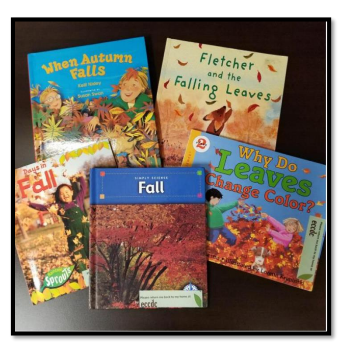
Children's Literature About Fall Wonderful Fiction and Non-Fiction books about Fall to further children's interest and understanding of the season.

This provocation for learning kit is bursting with splendid spring-filled loose parts from branches, wooden flowers, lady bugs, stones, etc. In addition, it includes other resources to spark children's curiosity about spring such with English and French books.