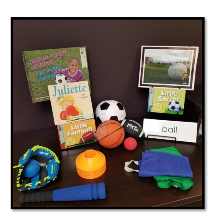
Summer Sports Equipment Soccer, Baseball, Basketball, Pylons, and more! This provocation for learning kit has everything you need for children to enjoy the summer sun and the sports it brings along with it.