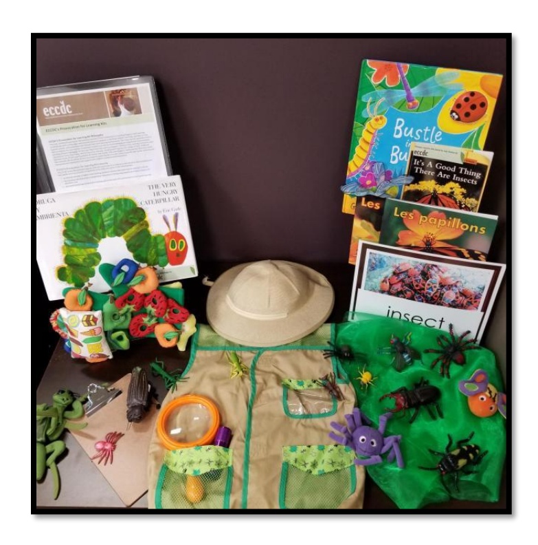
Exploring The Characteristics of Insects And Bugs With Infants & Toddlers

This provocation for learning kit is an excellent open-ended resource that allows children to use their creativity to construct bugs they have seen in their outdoor learning environment with natural loose parts!