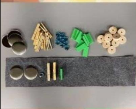
Patterning with Loose Parts