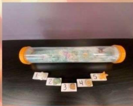
I Spy Loose Parts Tube