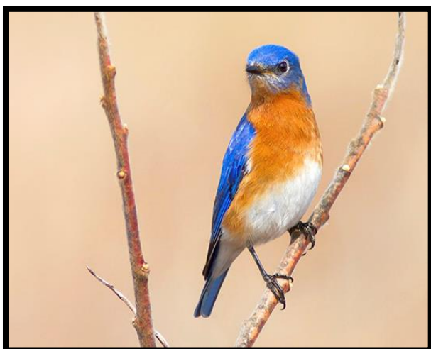
Listen to the Eastern Bluebird here .