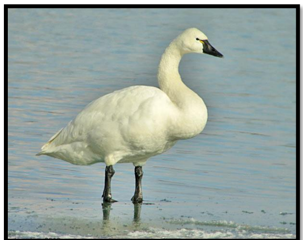
Listen to the Tundra Swan here .